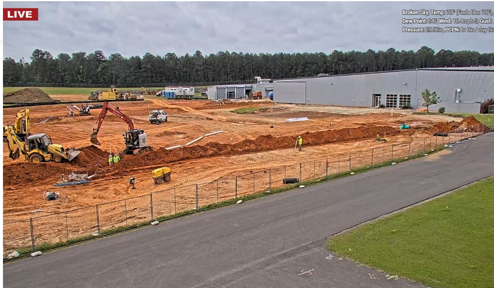
Site as Pictured 04.15.2026